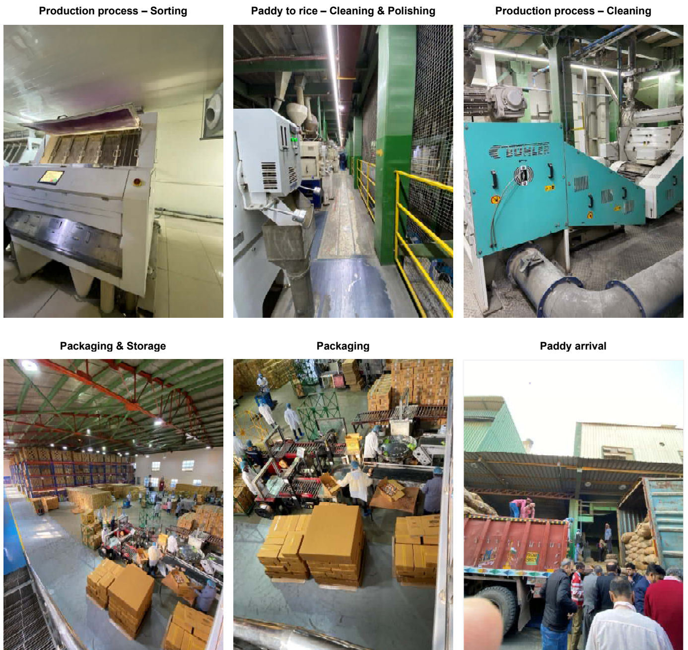
Fig 2 – Conventional rice processing