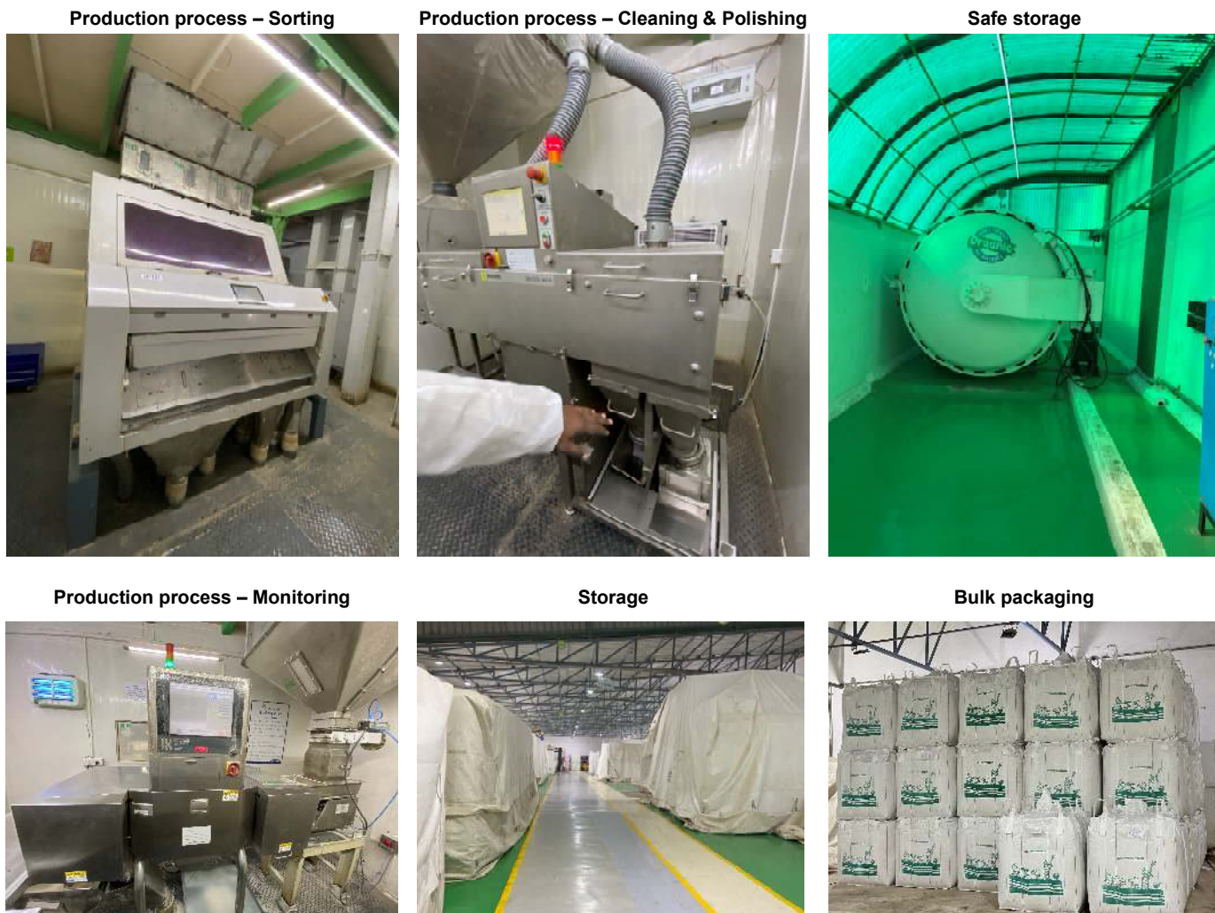
Fig 1 – Organic grain processing